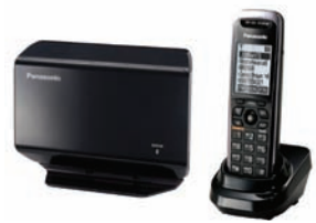
KX-TGP500 SIP Cordless Phone System with Location-Free Base Station and 1 Cordless Handset