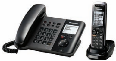
KX-TGP550 SIP Cordless Phone System with Corded Handset Base Station and 1 Cordless Handset

In today's hypercompetitive business environment, every dollar counts. Now you can get a leg up on the competition with the Panasonic TGP550 series SIP Cordless Phone System. SIP not only means reduced hardware costs but also the potential for huge savings on your monthly phone bill . Since the system is expandable, you can quickly and easily add up to 6 cordless handsets —each with its own DID number. All you need is a single Internet connection.